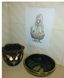
Kitchen Altar to Hestia. Book of Eucalypt