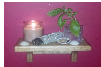
Inviting Hestia. Adirondack Earth Lore