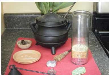
The Wizardess' Altar for Hestia. Harmony and Mystery ~ wordpress